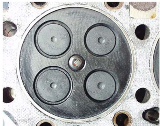
Bottom of cylinder head.