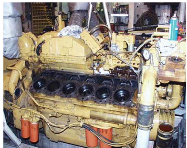
3412 Cat after 3860 hrs of operation with ALGAE-X fuel conditioner.