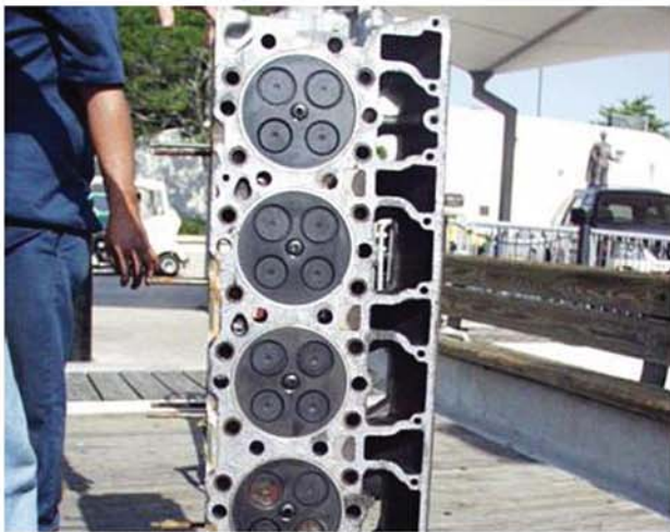
Cylinder head as it appeared after removal and before clean up.

This engine was rebuilt in 1998 and has since then run 3860 hours. The cylinder head had to be removed to repair a damaged intake valve, the damage was caused by a failure of the automatic timing advance. The Princessa implemented ALGAE-X Fuel Conditioning Technology in August of 2000, and since then has approx. 1000 run time hours. The attached pictures demonstrate the results of using ALGAE-X treated fuel.