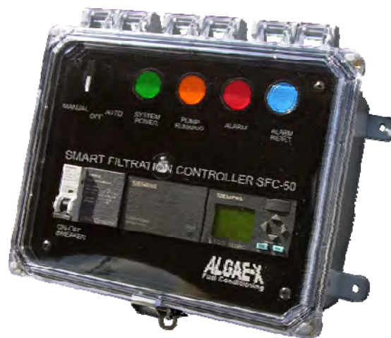
SFC-50 Smart Filtration Controller

Digital flow meter, Rotor Sight Glass, Foot Valve AFC-705 Fuel Catalyst