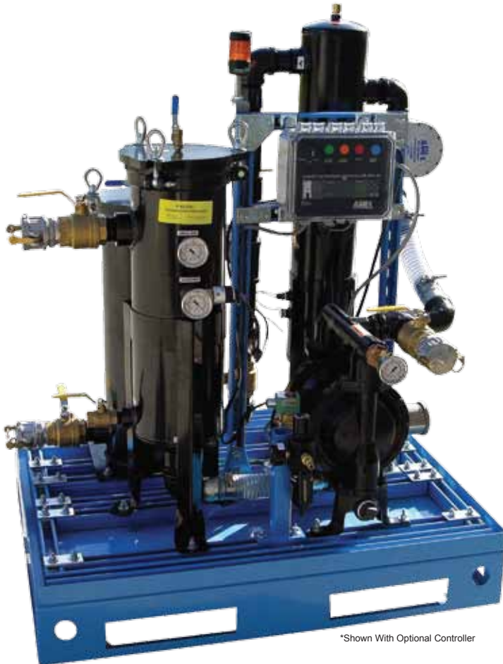
*Shown With Optional Controller

AXI’s mobile tank cleaning systems excel in combining High Capacity Filtration & Water Separation with Compact Design and Low Operating Cost to provide Optimal Fuel Quality for Peak Engine Performance and Reliability.